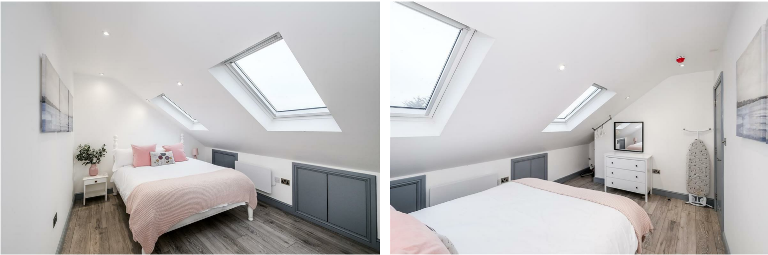
TOP FLOOR 429 sq.ft. (39.8 sq.m.) approx.